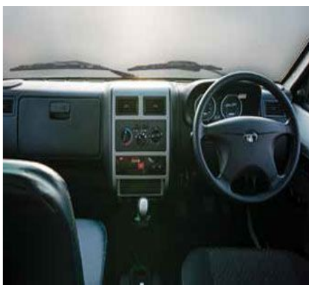
Lighting, Ventilation and AC