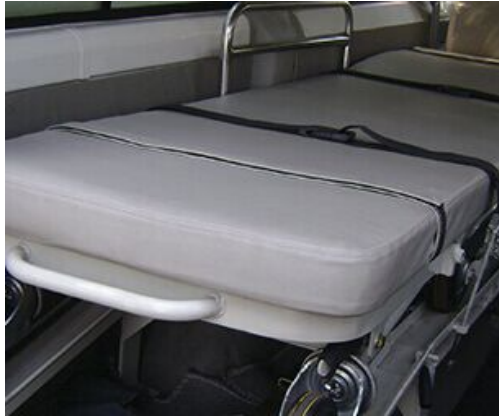
Foldable stretcher cum trolley