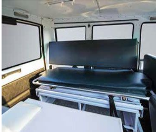
Spacious Interiors with provision for Oxygen Cylinder