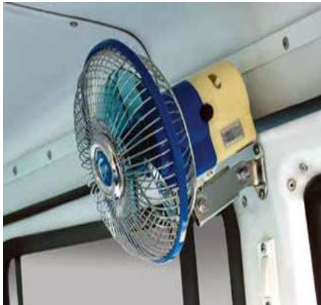
Fan in passenger compartment

Other Features: (Pic. used for sample only)